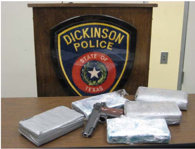
Recovered drugs and weapon